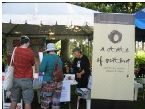
The A State Of Writing Banner at Qld Day.